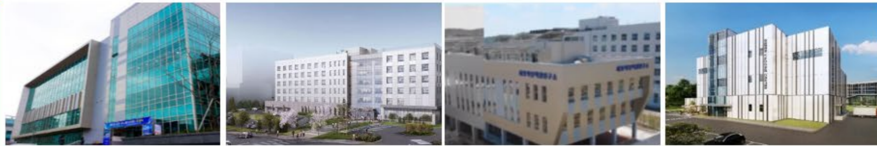
Rich R&D Facilities for Bio Health Industries