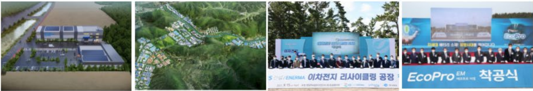
Designation of Battery Regulation Free Zone & $2bn Investment by Companies