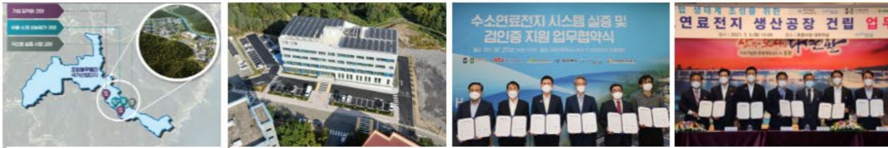
Establishment of Hydrogen Fuel Cell Cluster