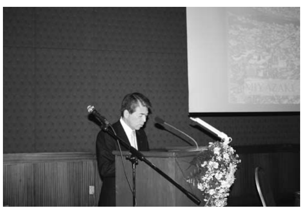
"New City Development Strategies – Efforts of Miyazaki City" Mr. Tadashi Tojiki, Mayor of Miyazaki City