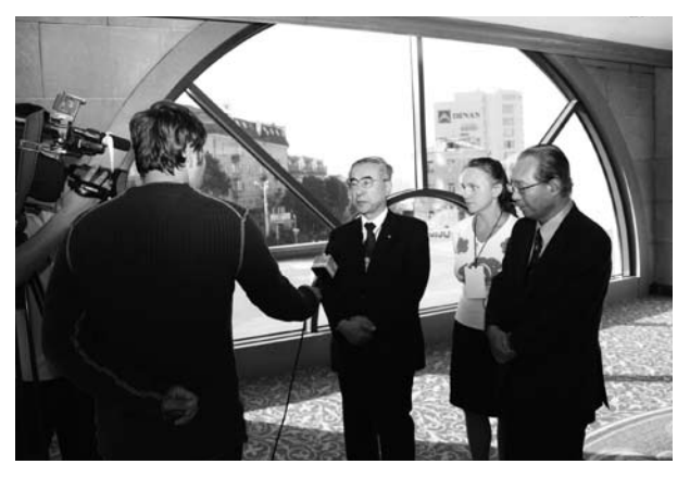
Interview by local media