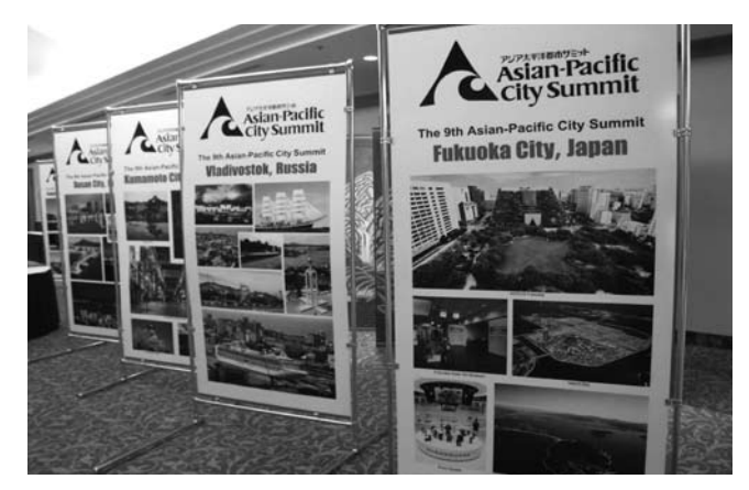
The city photo exhibition