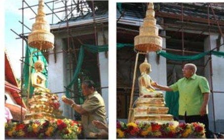
Bangkok Governor and the Permanent Secretary for BMA are bathing the Buddha image