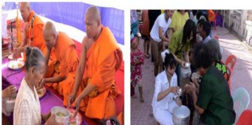
Watering to the monks and the elders to beg for the blessing