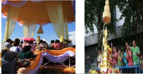
Songkran Festival (Watering Festival)