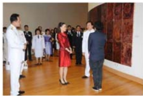
Siam Smile City