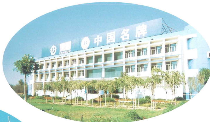
Economic Development Zone