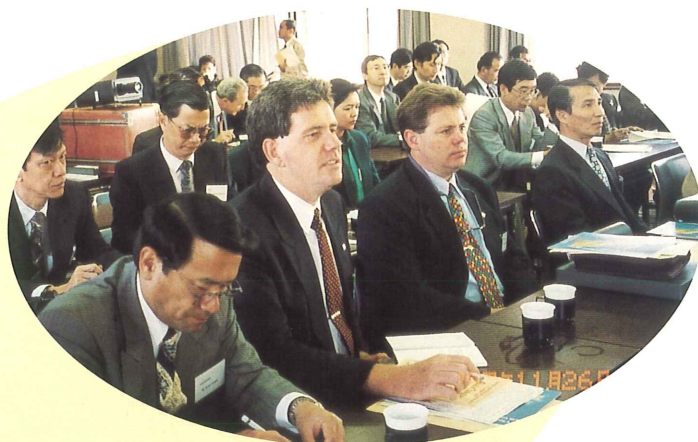
Lecture in the training room, Refresh Farm