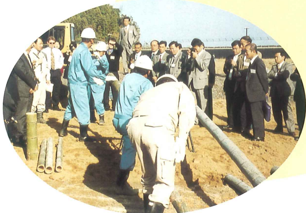
At the Imazu Landfill