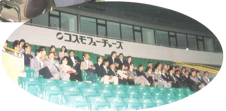
At the Fukuoka Dome