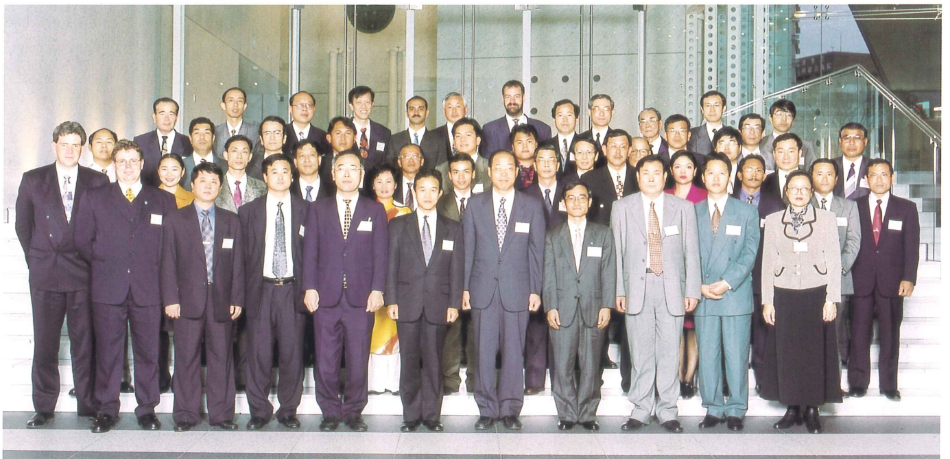
Commemorative Photograph of Participants