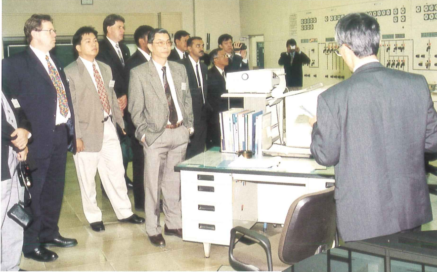
At the Tobu Clean Park