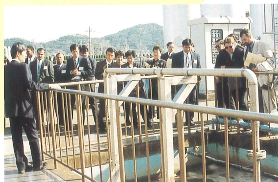
At the Waste Water Treatment Center