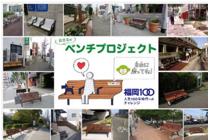
Photographs of the benches around Fukuoka City Hall and the Bench Project logo

Fukuoka is striving to become a city where every single citizen is able to go out easily by promoting the Bench Project, a project that places benches in everyday locations around the city such as bus stops. The benches are not just placed on paths and city facilities, but by providing a subsidy system to purchase the benches for (bus stops and other busy areas on) private land, Fukuoka City is promoting the benches with the cooperation of local communities and companies.