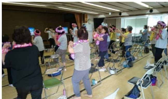
One service certified by the Fukuoka Health Laboratory