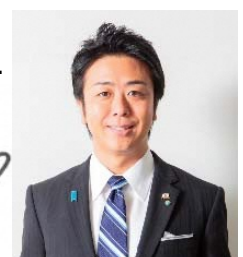
TAKASHIMA Soichiro Mayor of Fukuoka City