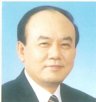
Busan Mayor Ahn, Sang-young