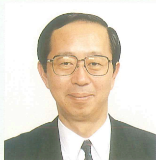
Miyazaki Tsumura Shigemitsu