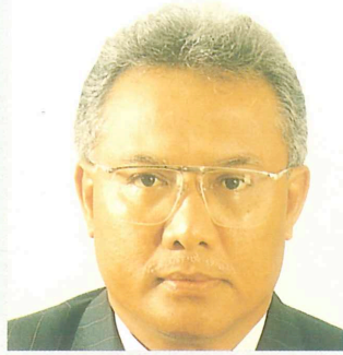
Ipoh Dato Talaat Husain