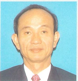
Ho Chi Minh