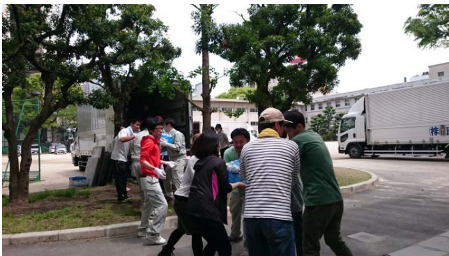
<<Photo left: Truck loaded only with toilet paper Photo right: Volunteers loading supplies>>