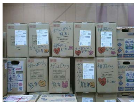
<<Photo left: Volunteers sorting the supplies gathered at the former Daimyo Elementary School Photo right: Relief supplies sent in, filled with caring thoughts>>