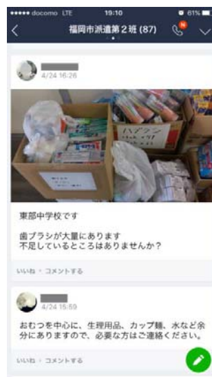
<<Photo: LINE group chats created amongst dispatched Fukuoka City employees to supplement the supply provisioning system>>