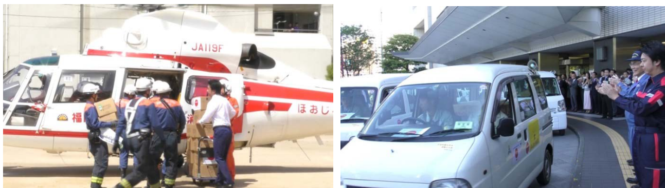
<<Photo left: Relief supplies being transported on the day after the main shock

Moreover, local governments that have few experiences in dealing with disasters lack the understanding that the required actions and information would change as time passed—from 24 hours after the disaster, to 72 hours, and one week. What they need to work on would change continuously, from saving lives, to creating shelters, distributing supplies, recovering lifelines, issuing victims' certificates, constructing temporary housing, and so on. But they would be too busy dealing with whatever required their attention at the time, causing them to fall behind on performing the necessary relief activities. Thus, instead of trying to tell these local governments about how to go about their relief activities from the sidelines, Fukuoka City initiated direct leader-to-leader communication with the local governments, and also dispatched people experienced in disaster-relief to work as core members of the local emergency response center to provide advice on how to do things more efficiently and to develop aid initiatives that look towards the future.