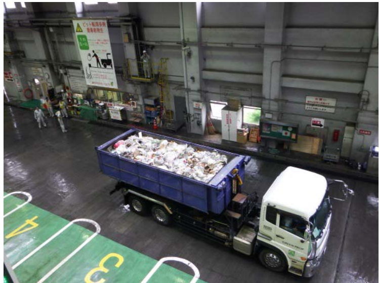
<<Photo left: Helping with disaster refuse collection at the disaster-affected area Photo right: Disaster refuse brought to the incinerator plant in Fukuoka City>>