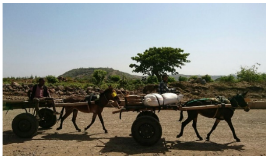
Bahir Dar, a tranquil rural city

Over the next year and a half, UN-Habitat will be working to help improve existing dump sites and create new landfills, water treatment plants, and other facilities.