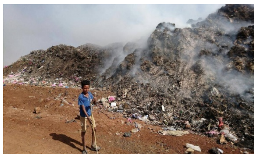
Smoking refuse piles