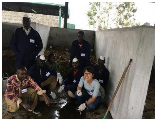
Working alongside local staff