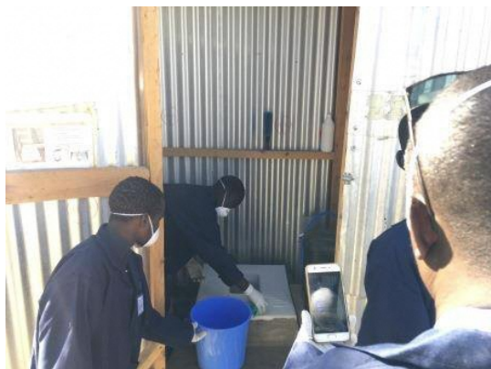
Workers installing the toilets

Here are the latest developments from UN-Habitat's Kenya Kalobeyei Project, currently being conducted with support from the Japanese government: UN-Habitat signed a contract with LIXIL Corporation in February of 2018 to bring their "Green Toilet System", a sustainable sanitation solution, to the Kalobeyei refugee settlement. With LIXIL's assistance, training sessions for the system were held, and local residents and refugees alike underwent professional training over the course of one week. Through this system, not only will the people of the refugee settlement have safe and sanitary lavatory facilities, but the compost made from the waste it produces can be used as fertilizer, helping build a foundation for residents' economic independence and sustainable living.