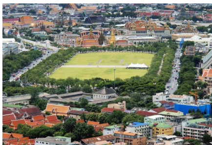
2011 Award – Utilization of Historical Sites in Bangkok