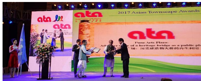
September 28, 2017 Awards Ceremony in Yinchuan

This year for the first time, previously awarded cities were asked to present on their initiatives, report on how their areas are doing now, and look at how much their projects had been contributing to the development of their region.