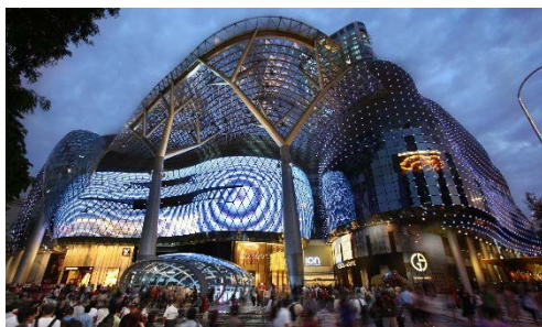
2010 Award – Orchard Residences in Singapore

Though the Asian Townscape Awards may seem rather competitive by being presented in an ‘award’ format, in actuality the goal of the event is to bring compelling initiatives from the various cities of Asia to the forefront, and allow the participating cities to collaborate on how to continue to adapt to change, and better built their cities into the future. This notion of collaboration, mutual learning, and cooperation between cities is something that squarely aligns with the ideals of the Asia-Pacific City Summit.