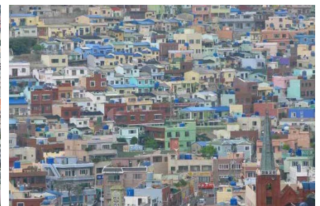
2012 Award – Gamcheon Culture Village in Busan