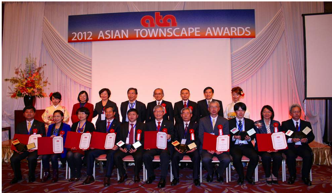
Representatives of cities awarded the grand prize