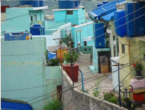
City preservation and regeneration that utilizes each city's characteristics GAMCHEON Culture Village (Busan Metropolitan City)

Creating a balanced hospital environment that incorporates the beauty of nature through trees and plants and provides heat insulation, as well as providing people with an improved environment that gives them comfort and aids the recovery process.