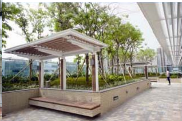
A harmonious balance between people and nature/the environment Tseung Kwan O Hospital New Ambulatory Block (Hong Kong Special Administrative Region)