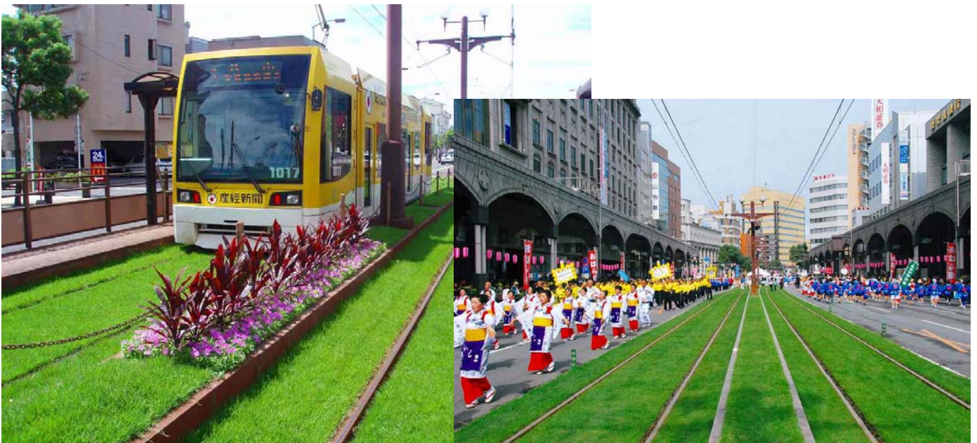
Making major contributions to greening in cities Kagoshima City Tram Track Turf - laying Project (Kagoshima City)

The award ceremony for the 2012 Asian Townscape Awards (hosted by UN-HABITAT Regional Office for Asia and the Pacific, Fukuoka Asian Urban Research Center and others) was held on November 27, 2012. This award, which was established in 2010 to honor outstanding townscapes and urban development in cities throughout Asia, was awarded to noteworthy projects in 9 cities under theme of “Comfortable City and Quality of Life.” Awards were given to 9 groups in Korea, China and Japan, with cities/groups from Asian-Pacific City Summit members Kagoshima City (Japan), Busan Metropolitan City (Korea) and Hong Kong Special Administrative Region (China) awarded the grand prize.