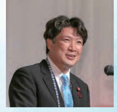
KAWAKAMI Shinpei Chairperson of Fukuoka City Council